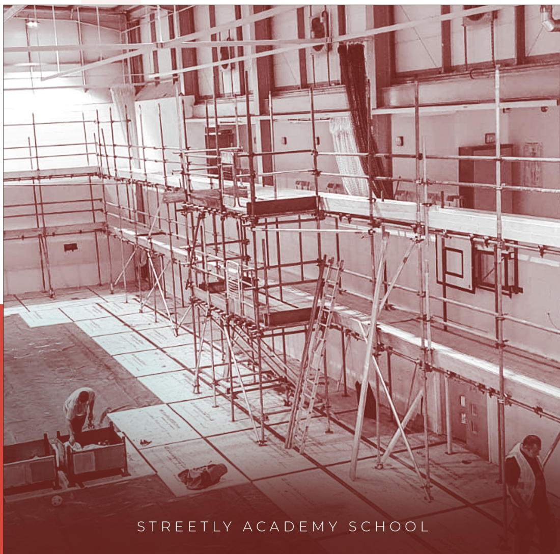
STREETLY ACADEMY SCHOOL